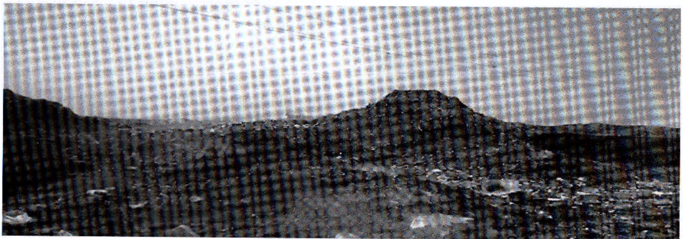
Fig. 2. Disposal site at Naregaon

Separate collection and management of Bulk Waste is most critical and cost effective way for waste management in city. The waste processing is also easier if such bulk waste is not allowed to get mixed with rest of waste. Such waste is more homogenous concentrated (containing mostly wet garbage) and thus can easily be treated and disposed without additional cost incurred on segregation Independent collection and transportation of waste from bulk producers helps in establishing a system of collection and transporting segregated waste [5].